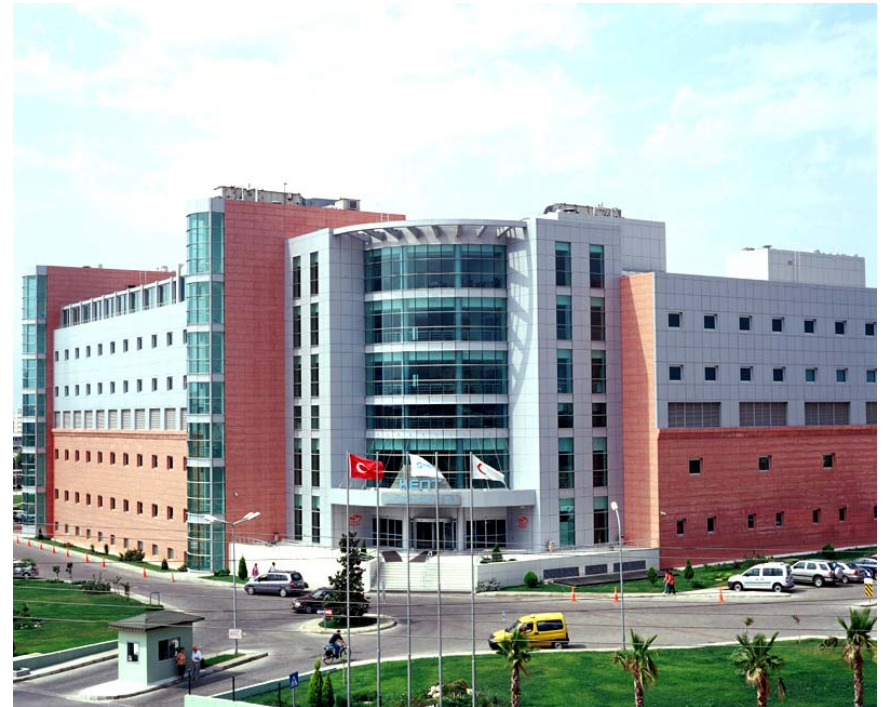
Kent Hospital, Izmir