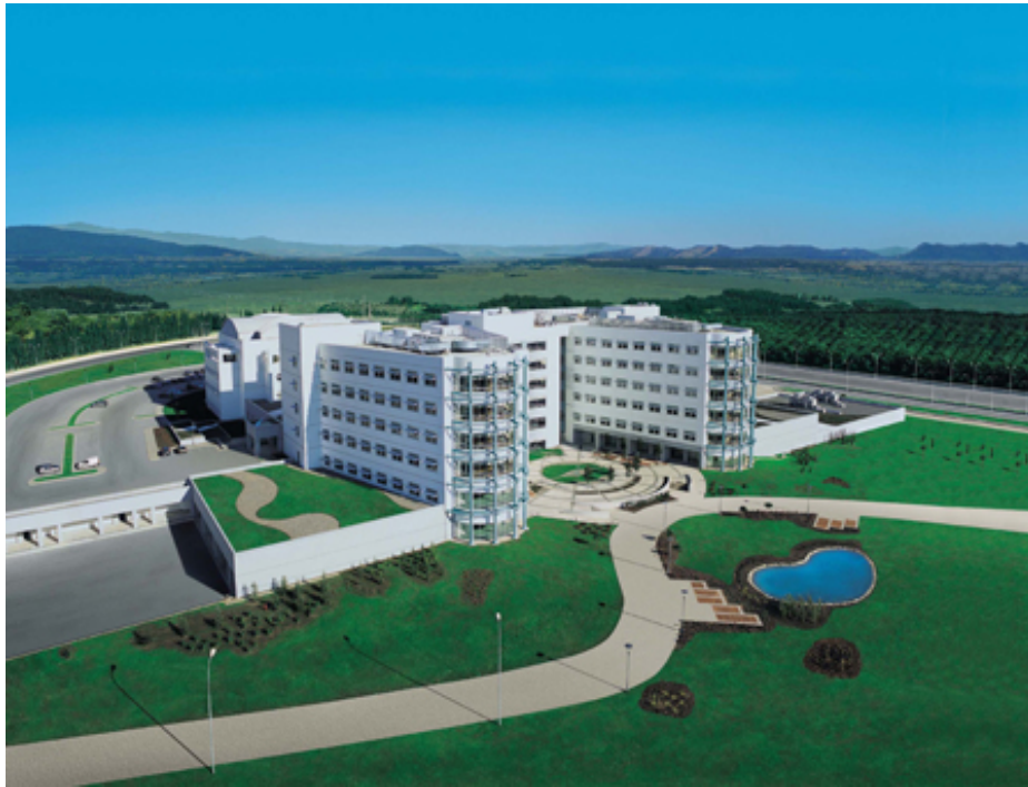
Anadolu Medical Center, Istanbul